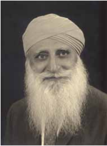
Dr. Bhagat Singh Thind (1892–1967)